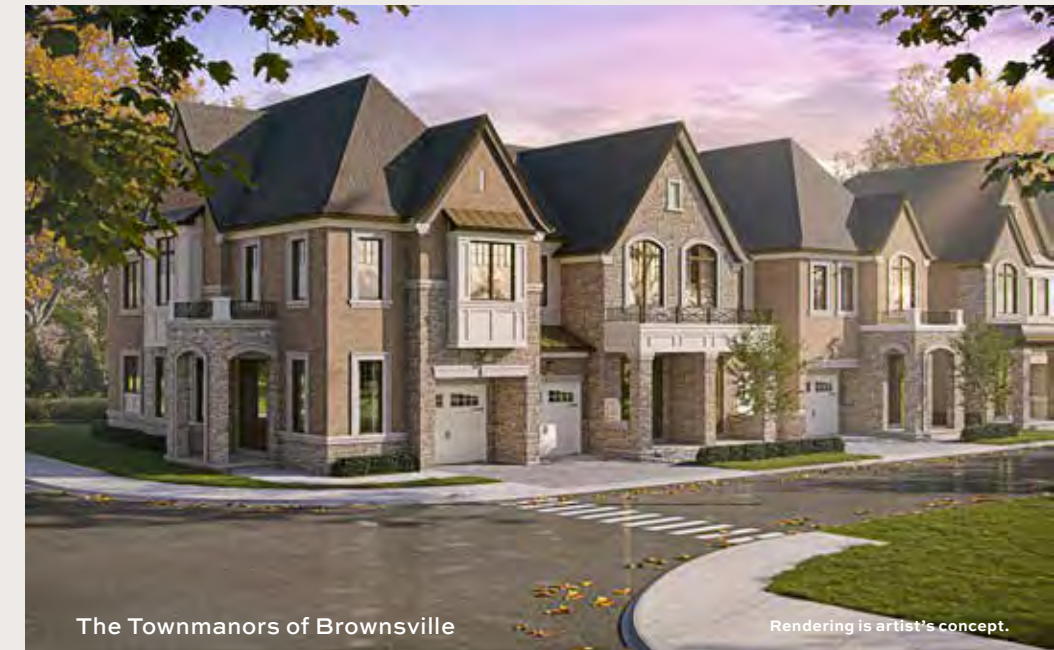
The Townmanors of Brownsville

At Sunny Communities, we develop with a vision in mind: To make every day in one of our homes feel like a sunny day. It is not just about the homes themselves, but about the security and happiness that comes from living in them.